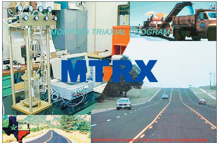
Figure 3. New Texas Triaxial Design System for Windows.

These new tools are the next step in TxDOT's continuing