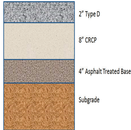
Figure 3. Pavement Structure of Loop 820 Test Sections.