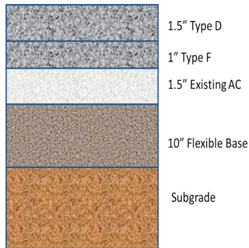
Figure 1. Pavement Structure of SH 15 Test Sections.

The existing pavement was asphalt concrete pavement with some transverse and longitudinal cracking. The GPR data were collected before the milling work and showed that the existing AC pavement thickness was about 2.5 inches. After that about 1 inch of the existing pavement was milled and was replaced with 1 inch type F mix. No obvious transverse cracks were observed in the shoulder or the milled surface during construction. Figure 1 shows the pavement structure of the SH 15 test sections.