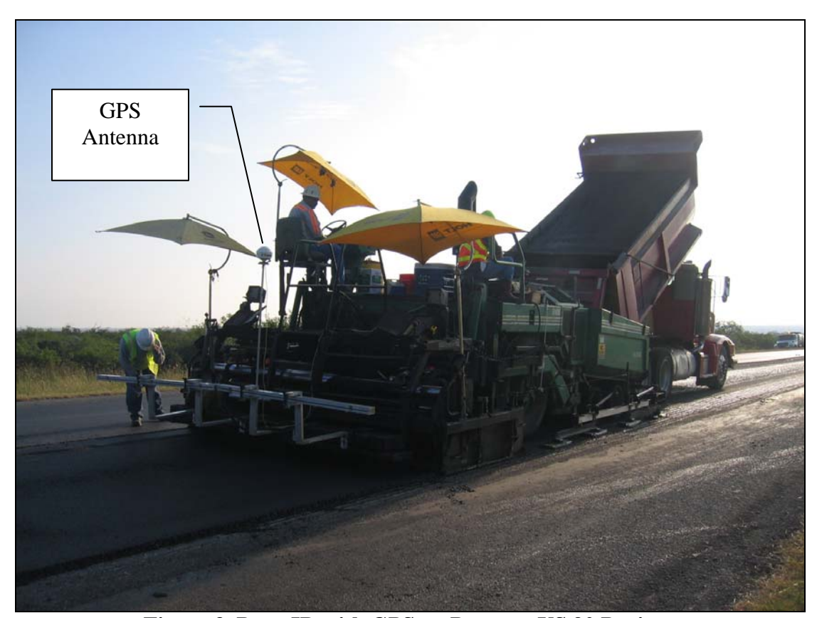
Figure 3. Pave-IR with GPS on Paver at US 90 Project.

A Pave-IR system retrofitted with GPS collected thermal plots during construction. Figure 3 shows the Pave-IR system with GPS installed on the paver. An antenna mount simply slips into holders on the infrared-bar mounts to secure the GPS antenna in place.