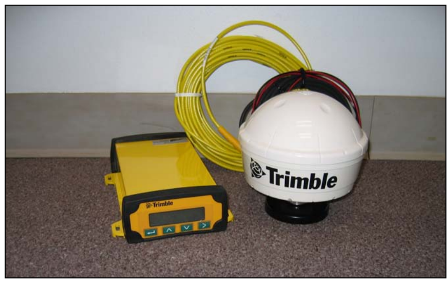
Figure 1. Trimble DSM232 System.