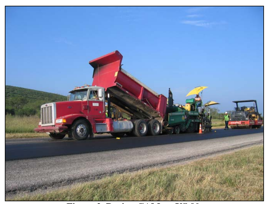
Figure 2. Paving CAM on US 90.

To collect the thermal profiles with GPS, TTI updated the Pave-IR collection software to include GPS functionality. Each time a scan of temperatures is recorded, the GPS coordinates are also recorded. On September 23, 2008, TTI researchers collected thermal data on a crack-attenuating mix (CAM) paving project in the San Antonio District. The project site was on US 90 just west of Uvalde. A Barber Green BG-260C paver was used to place the mix, which was produced in Uvalde approximately 15 miles away. End-dump trucks transported the mix and off-loaded the CAM directly into the paver hopper as Figure 2 illustrates.