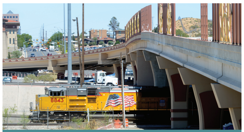
More Information: tti.tamu.edu/policy/how-to-fix-congestion