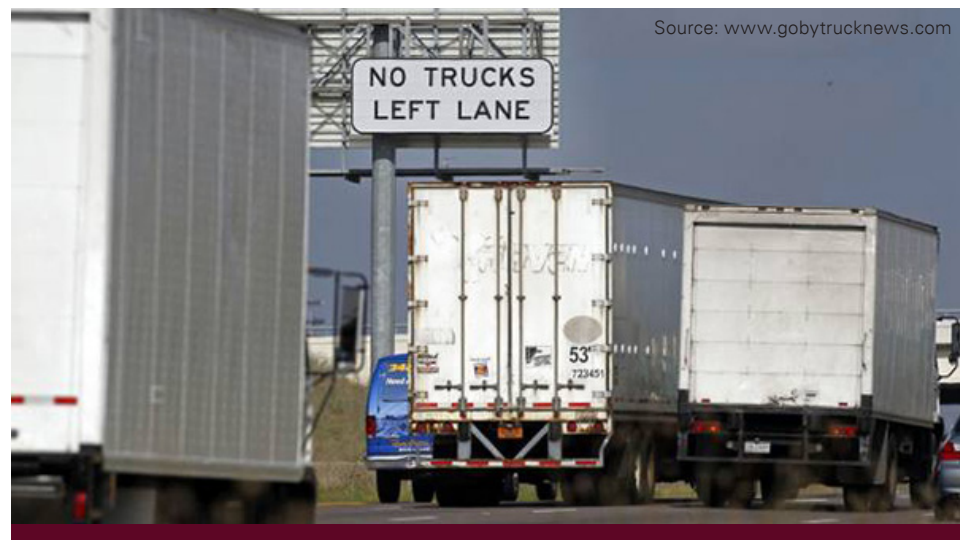
More Information: tti.tamu.edu/policy/how-to-fix-congestion