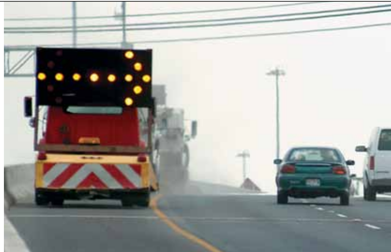
A mobile arrow panel alerts motorists to an upcoming lane merge.

Utility companies in Florida, in order to follow federal guidelines on merging taper lengths, sometimes spend 30 minutes to set up cones to spend 5 minutes changing a lightbulb. This time inefficiency led the Florida Department of Transportation (FDOT) to call TTI for research on using shorter merging taper lengths for short work duration activities, while also minimizing risk to the worker and motorist.