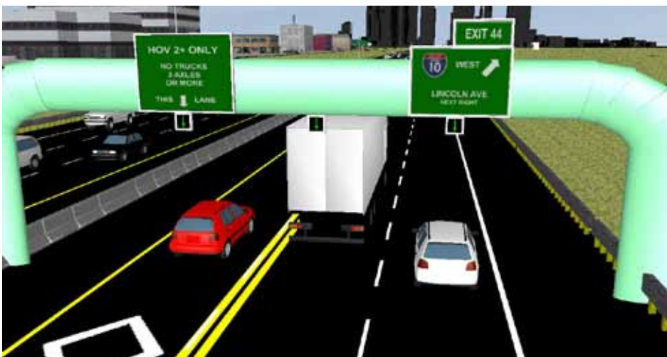
Microscopic simulation of managed lanes