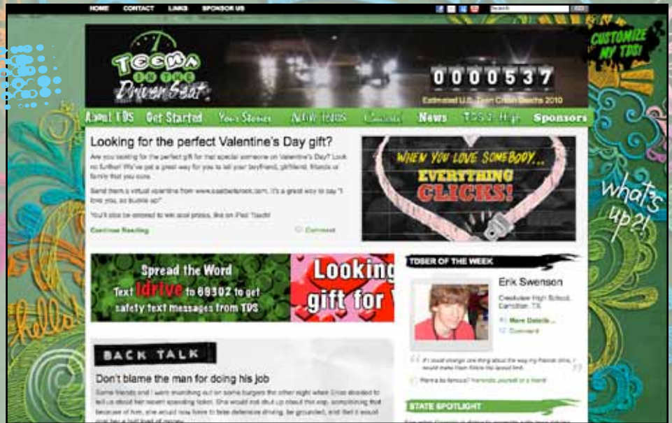
The TDS website, http://t-driver.com , went through a major renovation this year to appeal to its primarily teen audience.