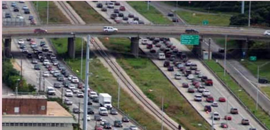
A mileage-based user fee may be one option to reliably fund maintenance and expansion of Texas roads.

In a classic line from the movie Back to the Future , as Doc Brown's DeLorean flies off in search of a sequel, the eccentric scientist famously says, "Where we're going, we don't need roads."