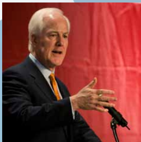
Sen. John Cornyn was the keynote speaker.

Keynote speaker Sen. John Cornyn pointed to recent innovations that have helped ease congestion: off-peak road use, carpooling and managed lanes. But, "there are even more revolutionary ideas such as wireless connectivity initiatives and the Freight Shuttle being developed by the Texas Transportation Institute," he said. "While I believe our transportation problems are serious, I think they are solvable." ■