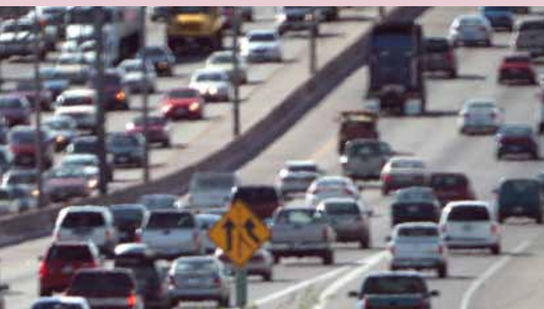
The two new centers recently established at TTI will focus on transportation solutions and policies for the future.

In addition to the involvement by TTI researchers, various other experts will assist in TEC research initiatives. Faculty from the Department of Agricultural Economics and the Dwight Look College of Engineering at Texas A&M University will play key roles in various center projects. ■