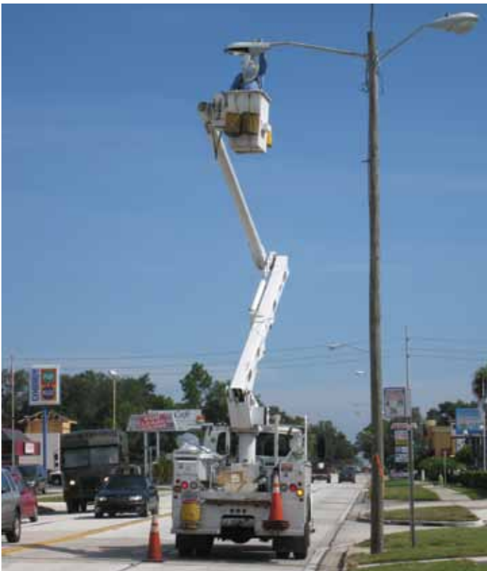
A utility crew performing maintenance on a streetlight requires a temporary work zone.

Conditions such as lighting, sight distance, traffic volume and speed all factor into the effectiveness and risk associated with temporary traffic control for utility work. Research on merging taper lengths — the practice of using cones to slowly merge two lanes of traffic into one — has been very limited.