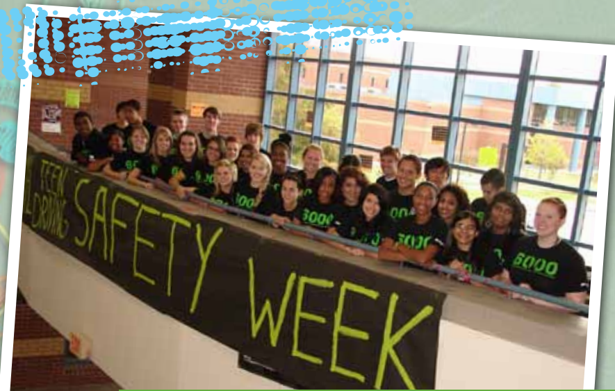
TDS teens at Creekview High School promote National Teen Driving Safety Week by hanging a banner in the school's main hallway.

"Using the influence of peer to peer seems to be a positive way to get our traffic safety messages to our Texas teen drivers. We are always open to innovative ways that could benefit our primary focus to reduce the vehicle crashes, fatalities and injuries among this age group."