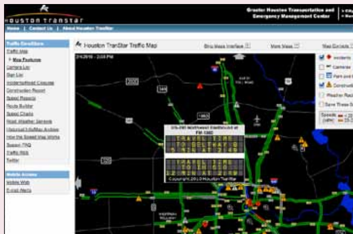
A screen shot of the Houston TranStar website.