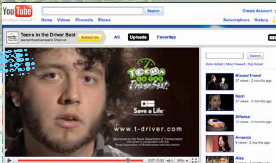
The Teens in the Driver Seat program won several awards in 2009 for its public service.

Prior to 2009, many great strides had been made with TDS as the number of program schools steadily increased, and it began to reach outside of Texas to other states. High expectations were set for 2009 as TDS aimed to add 125 new program schools, which would increase the number of program schools by more than 25 percent in a single year. The goal was not only reached but surpassed