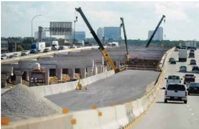
With so many highways to maintain and limited funding, project prioritization is of major importance to the Texas Department of Transportation.