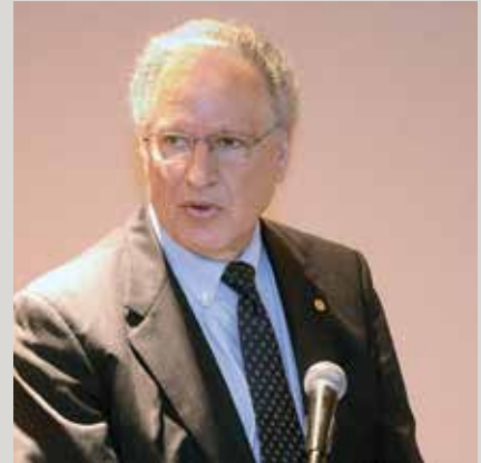
NHTSA Administrator Mark Rosekind was the keynote speaker for TTI's Traffic Safety Conference.

Each year, the Traffic Safety Conference, sponsored by the Texas Department of Transportation and TTI, brings together public policy makers, traffic safety practitioners,