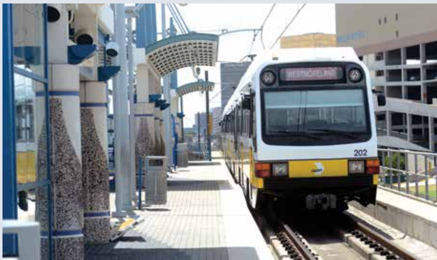
DART is the largest light-rail system in the southern United States by ridership.

TTI researchers developed a web-based model for DART that provides macro-level estimates of the potential economic impacts and benefits