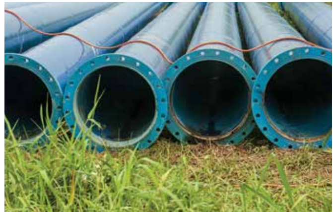
TTI researchers have investigated the efficacy of using seawater desalination combined with a pipeline network to distribute water.

associated with opening new DART stations to increase the service agency's area. These impacts include the additional property tax revenues, sales tax revenues, employment and economic activity associated with the development of each new station.