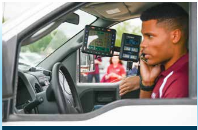
TEES will team with other Texas A&M agencies, including TTI, to conduct advanced transportation research at the new RELLIS Campus.