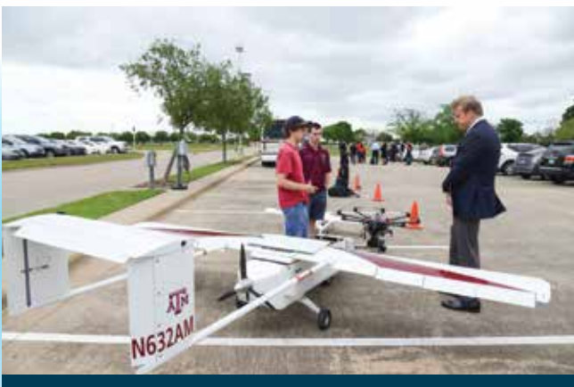
Working with advanced technologies, Texas A&M students will learn by doing as part of the Campus Transportation Technology Initiative.

"We believe we can offer the transportation industry and other public- and private-sector partners unique