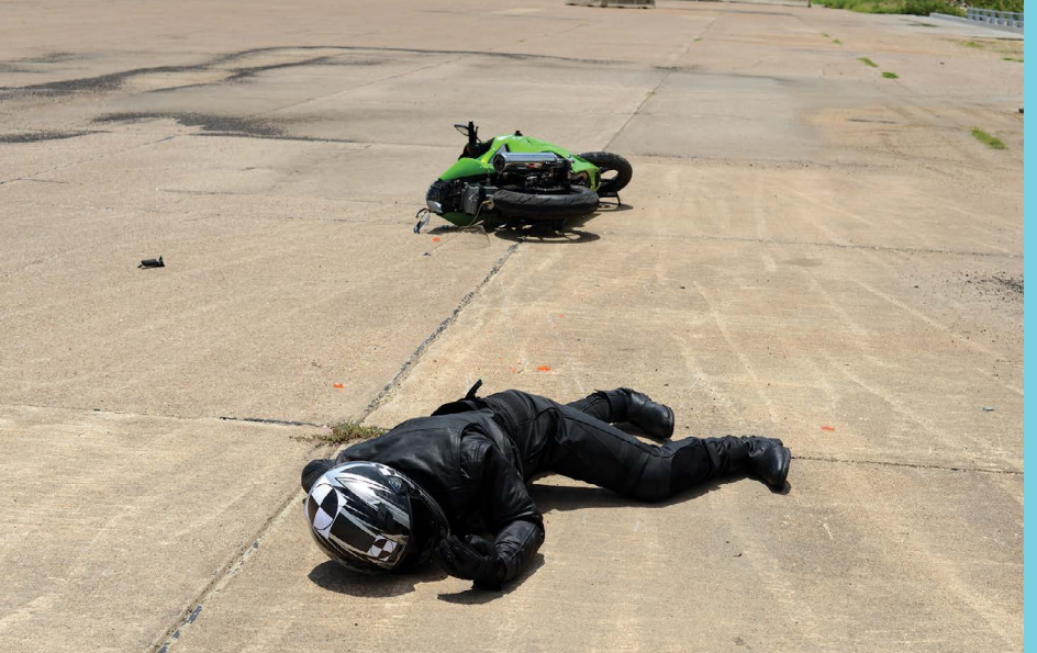
Similar crash tests have been done at TTI in the past, testing trajectory and interaction between the motorcycle rider and the net system during an impact event.