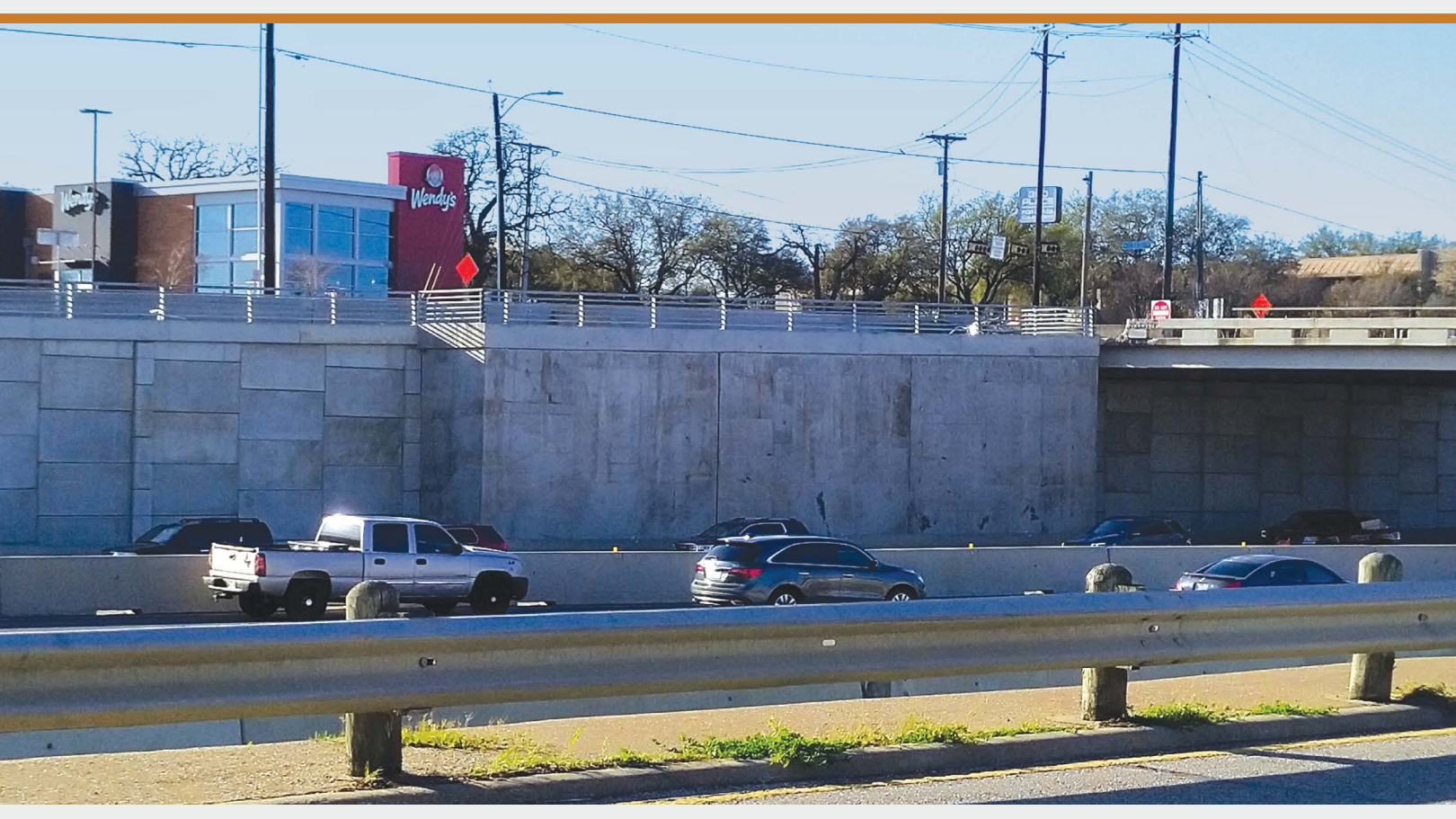
Highlighting the revised design (extended portion) of the retaining wall on TX 360 north of IH 30. This portion of the retaining wall was extended due to a change in the foundation design to mitigate a conflict with a utility duct bank.

Noise walls and retaining walls serve different purposes but have similarities in terms of the design and construction process. However, construction of these walls may face issues with utilities, phases of construction, and access. Manuals and design guides mention these concerns but fail to lay out applicable solutions.